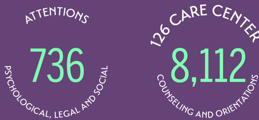
Graphic 1. Number of counseling and orientations provided by the 126 Care Center nationwide, El Salvador, from September to October 2023

Data analysis from the 126 Care Center nationwide between September and October 2023 reveals several key points. In these two months, a total of 8,112 counseling and orientations were offered, although a significant decrease in their number was observed, going from 6,634 in September to 1,478 in October, which represents a drop of 77.7%. This notable decrease could be influenced by both internal factors of the center and changes in the needs of the community. (See Figure 1).